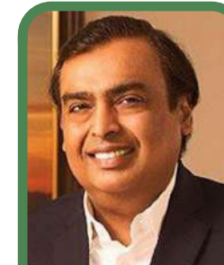
Mr. Mukesh Ambani Chairman, Reliance Industries Limited