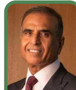
Mr. Sunil Bharti Mittal Founder and Chairman, Bharti Enterprises