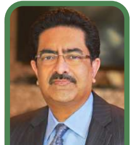
Mr. Kumar Manglam Birla Chairman, Aditya Birla Group