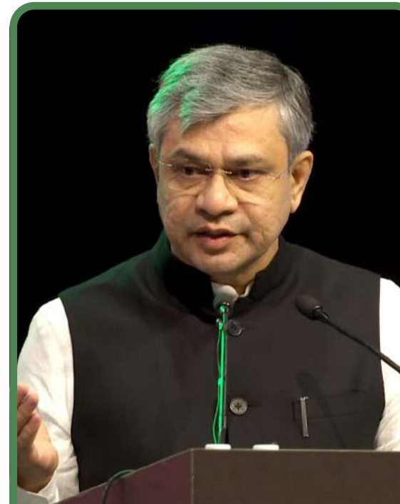
Shri Ashwini Vaishnaw Hon'ble Minister for Communications, Electronics & Information Technology & Railways, Government of India

Hon'ble Prime Minister Shri Narendra Modi