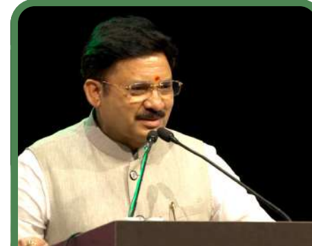
Shri Devusinh Chauhan Hon'ble Minister of State for Communications, Government of India